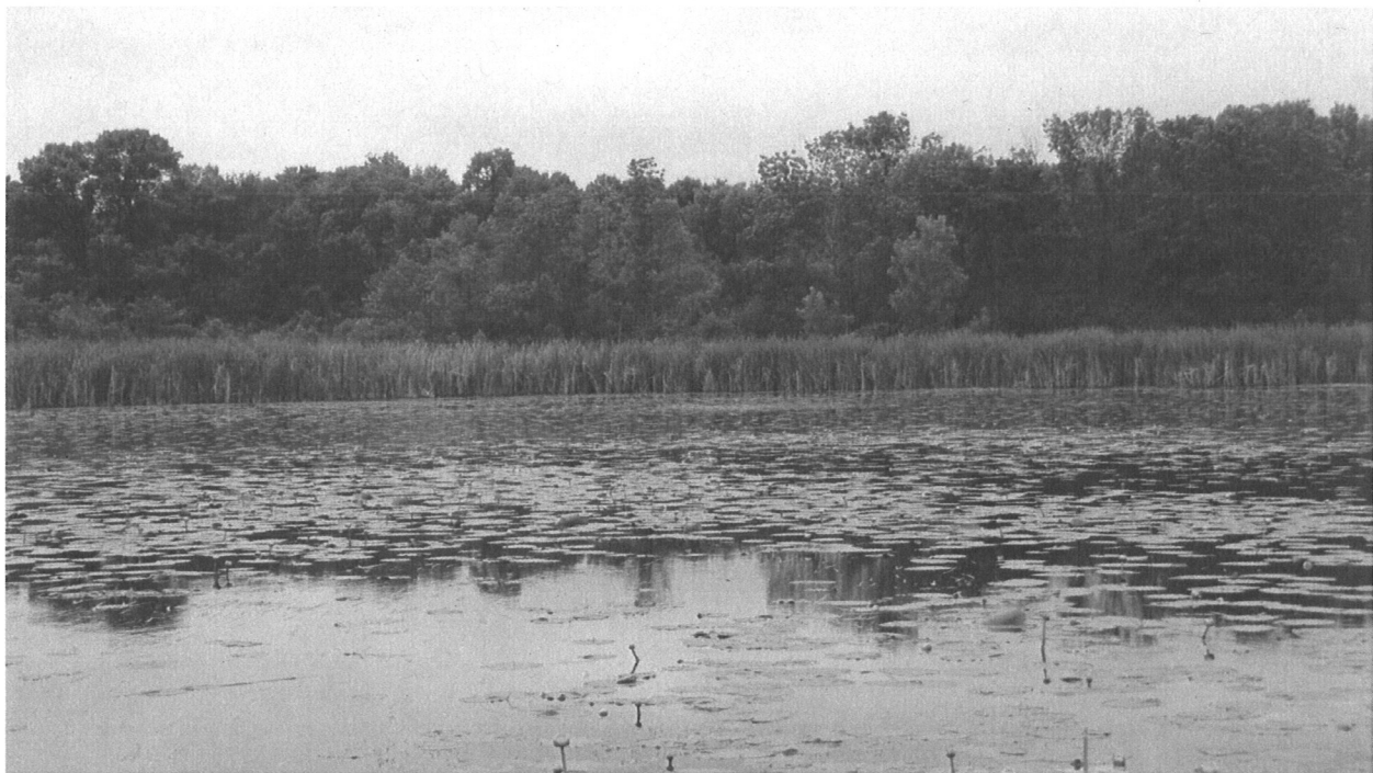
Figure 1: Waypoint 3, Pic IMG_0217 Yellow pond lilies near inlet on Lake Calhoun, 17 June 2009.

Overall: The surface water temperature was 68° Fahrenheit and the water transparency with use of a secchi disc was 6 feet. Eurasian watermilfoil has never been confirmed on Lake Calhoun but, it has been confirmed in neighboring Green Lake and water flows from Green Lake into Calhoun. After delineating the lake and spending much time near the inlet, we could not confirm the presence of Eurasian watermilfoil on Lake Calhoun. Much native plant vegetation was observed. There were extensive stands of Yellow pond lilies near the inlet, at sample sites 1-9 (Figure 1). Some Curly-leaf pondweed was found but only in rare quantities.