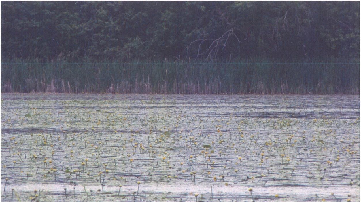
Figure 4: Waypoint 5, Pic IMG_0227 Yellow pond lilies near inlet on Lake Calhoun, 17 June 2009.