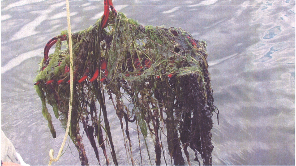
Figure 3: Waypoint 3, Pic IMG_0228 Rake full of native plant vegetation, 2009.