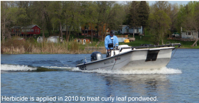
Herbicide is applied in 2010 to treat curly leaf pondweed.

The next step of the petition process was to appoint viewers to determine the benefits and damages to properties affected by the aquatic plant management program. A team of three viewers appointed by the MFCRWD Board studied the affected properties and determined individual benefits and damages. The viewers determined that the project would improve access to the lake and water quality, and that the impact of managing the curly leaf pondweed will provide a similar improved value to all properties having lakeshore